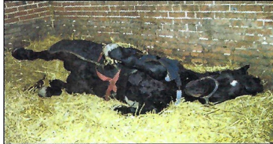
Horse rolling with abdominal pain i.e. colic.

roll and throw itself about in an uncontrolled and dangerous manner.