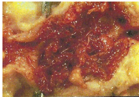
Redworm larvae at root of intestinal arteries.

To a certain extent - Yes. Regular deworming to prevent damage to the intestine and its blood supply helps enormously. Keeping to routine and avoiding sudden changes in management and feed type and time also helps. Horses and particularly their intestines are creatures of habit. Changes should be made gradually and carefully. Horses that are injured or having a break from exercise should not be bedded on straw. Many will eat