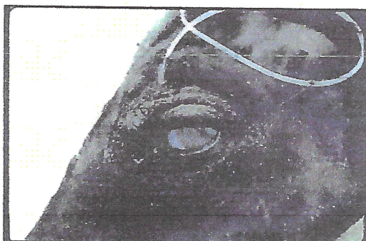
Indwelling tube inserted under eyelid to facilitate remote treatment.

Eye ointments and drops usually need to be applied several times a day. In some cases this treatment must be continued for several weeks. It is important that medication goes into the