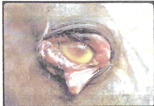
Traumatic injury to eye and eyelid.

This can range from bruising to full thickness wounds of the eyelids or surrounding tissues. Severe bruising may be associated with fracture of the bones around the eye. Your veterinarian should be called to examine any eye injury involving swelling around the eye or cuts to the eyelids. The eye itself may also be damaged. Sedation may be required in order to perform a thorough assessment of the injury if the region is very painful or the horse difficult to examine. Eyelid injuries usually require surgical suturing. Severe damage may necessitate reconstructive surgery under general anaesthesia.